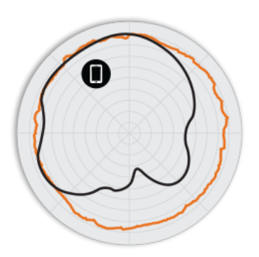
Figure 2. T610o 2.4GHz Azimuth Antenna Patterns