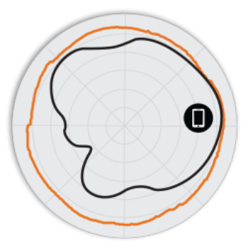
Figure 3. T610o 5GHz Azimuth Antenna Patterns