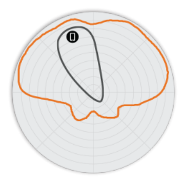
Figure 4. R750 2.4GHz Elevation Antenna Patterns