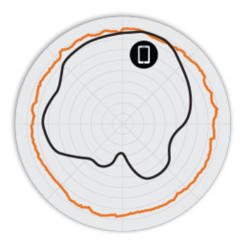
Figure 2. R750 2.4GHz AzimuthAntenna Patterns