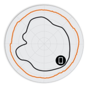
Figure 3. R750 5GHz AzimuthAntenna Patterns